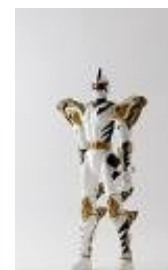
Prerak thinks Dynot-hunder has power