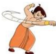
Sneha like Chota Bheem

( Complete the story with Champs favorite characters...)