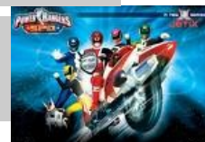
Santosh likes powerrangers

WRITE YOUR OWN STORY WITH ALL THE CHARACTERS GIVEN-