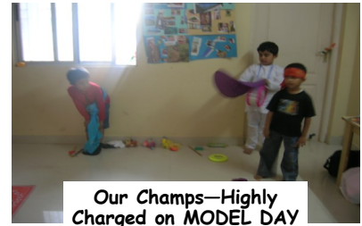
Our Champs—Highly Charged on MODEL DAY