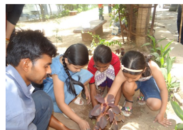
Champs are planting .....