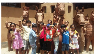
A trip to Anand Gram