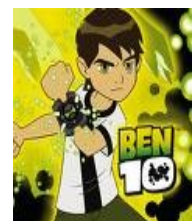
Nipun likes Ben-Ten