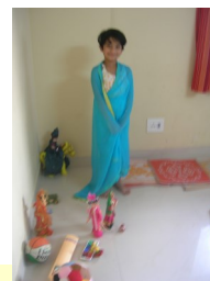
Champ explains our Village Life